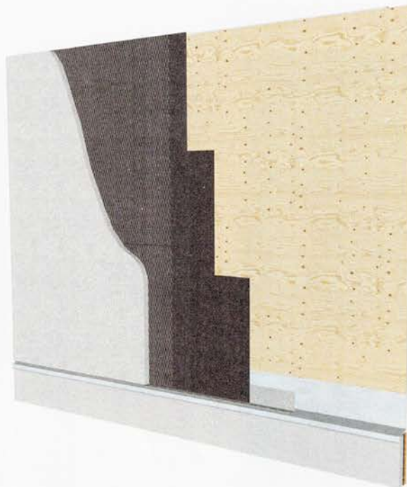
Stucco is commonly installed over wood framing with plywood sheathing or steel framing with gypsum sheathing back-up walls. Stucco is arguably low maintenance and adaptable to both classical and modern architectural styles.

Now, consider what adding a continuous exterior insulation requirement to a stucco cladding assembly requires. Without insulation, a rainscreen stucco system was easy to implement. Just create a cavity with a drainage mat between the vapor permeable WRB/AB (air barrier) and the stucco system. Cover the drainage mat with a lightweight filter fabric to keep the scratch and brown coats from clogging the drainage cavity. Flash all penetrations