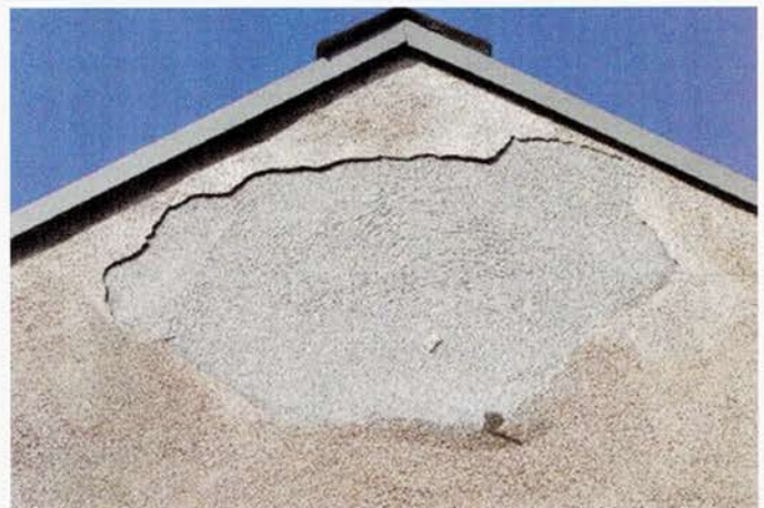
Stucco failure discovered on Schooner Cove condominiums in South Tampa, Fla., built by DR Horton.