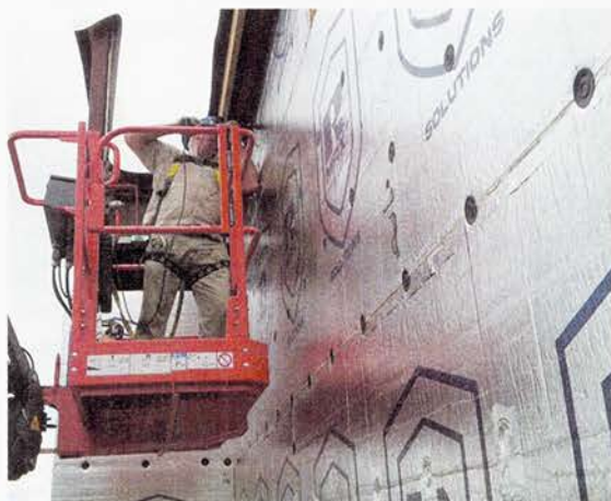
Exterior CI comes in many forms: polyiso, expandable polystyrene, extruded polystyrene, along with spray foam are some of the choices. Each available non-faced or with multiple options for facers such as aluminum foil or fiberglass laminated to the surface.

After weighing all the choices for exterior continuous insulation, with their various merits, drawbacks and limi-