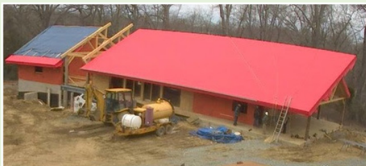
Potomac Watershed Study Center