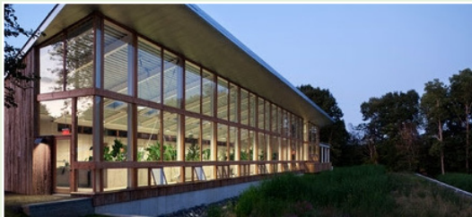
Omega Institute for Holistic Studies

VaproShield is honored to participate in the Living Building Challenge (LBC), a building certification program renowned for producing the “greenest” [buildings] anywhere.” Below are our LBC projects: