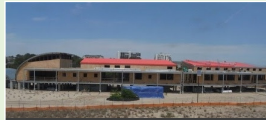
Brock Environmental Center